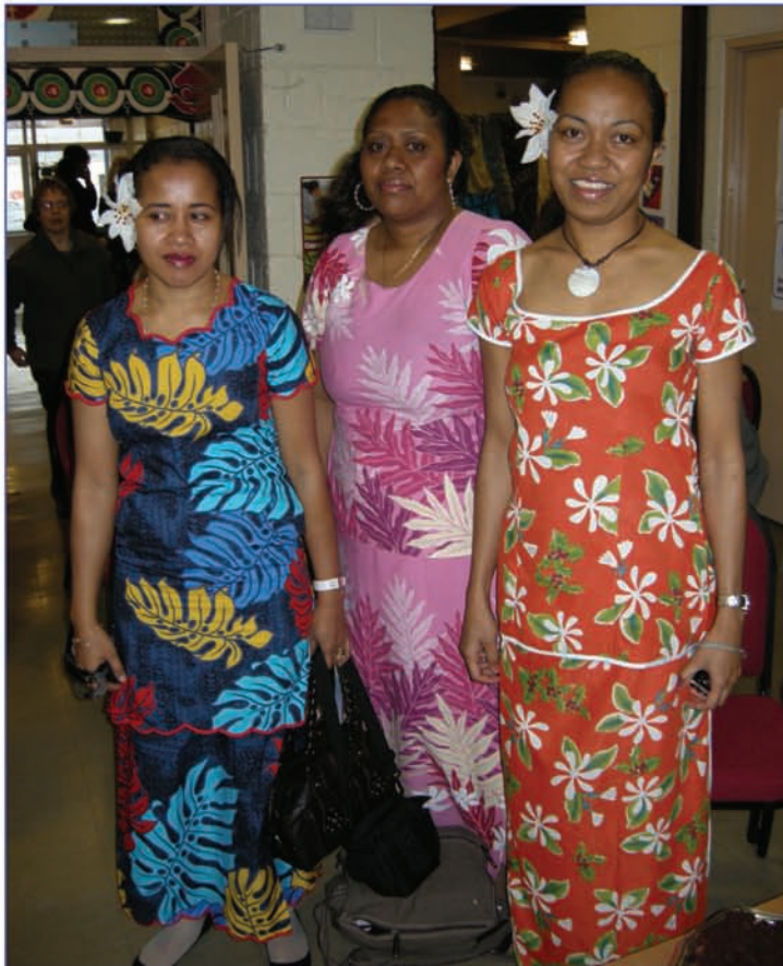
THESE Fijian ladies attracted many admiring glances when they appeared in traditional costume at the International Women's Day event — for report and more pictures, see page seven.

The Merkinch community newsletter, entirely written and produced in the Merkinch