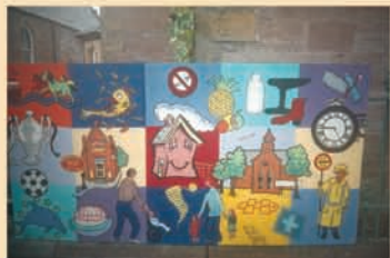
A Colourful Corner