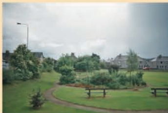
The School Park