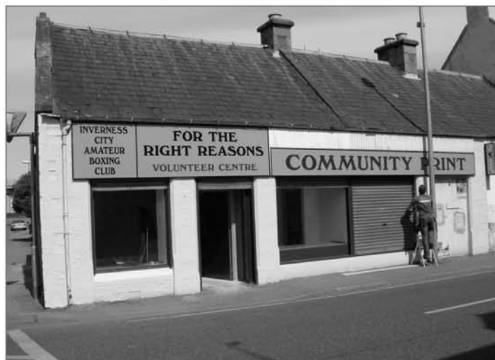
New volunteer centre and print shop in Grant Street

When the new premises held an open day on 12th July four