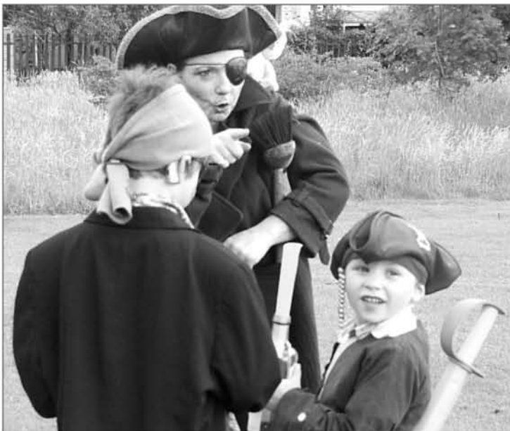
BELOW... The weather was unkind to the Treasure Island event in the West Field, but those taking part got well into their roles—here the captain has clearly spotted rival pirates coming over the horizon!