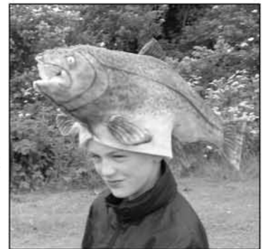
The parade saw lots of creative hats made by local schoolchildren including this wonderful salmon.

"Greenspace would like to thank everybody who took part,