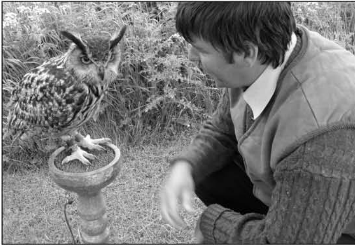
Among the birds on display was this fine European Eagle

Merkinch Greenspace has also helped pay for Hanging Baskets for Benula Road and in the near future will be looking at how the play area rear of Benula Road (Carse playing fields) can be improved.